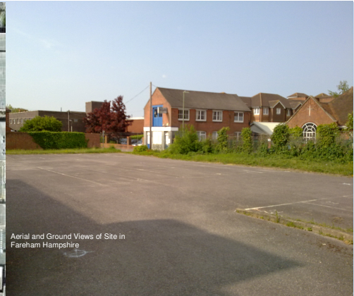
Aerial and Ground Views of Site in Fareham Hampshire